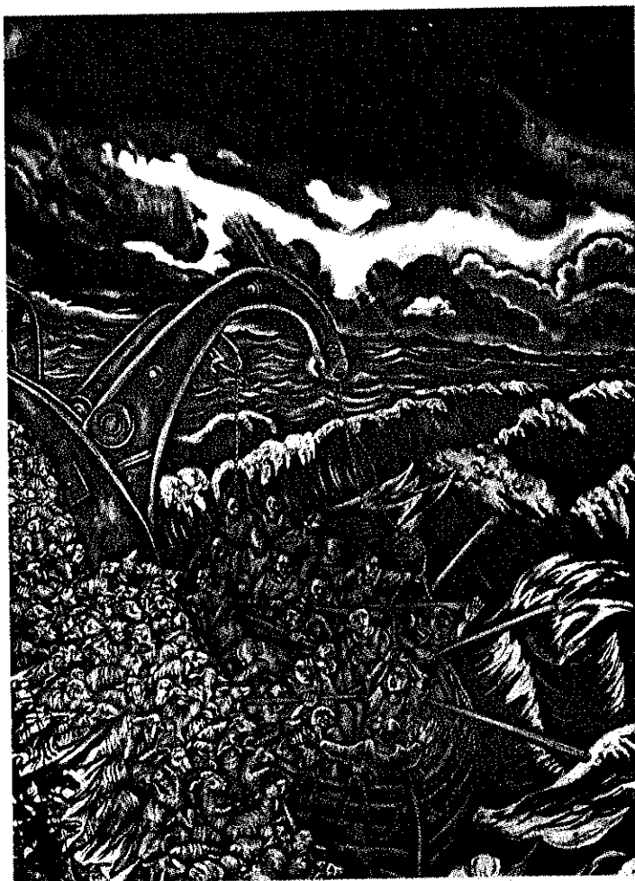
Above: Abandon Ship!

See the exhibit at Galerie St. Etienne, 24 W. 57th Street, Manhattan. For information, contact (212) 245-6734 or www.gseart.com .—C.C.