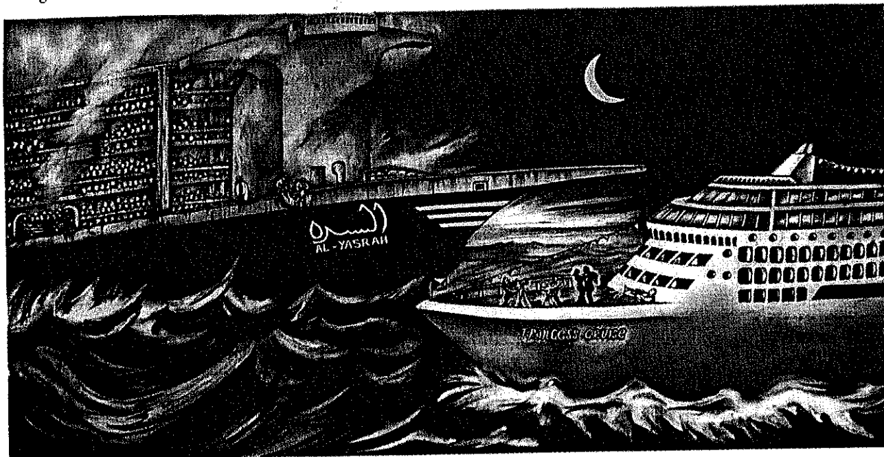
Below: Ships that Pass in the Night