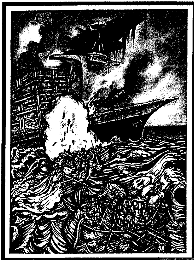
Sue Coe, "Goats Before Sheep," from SHEEP OF FOOLS